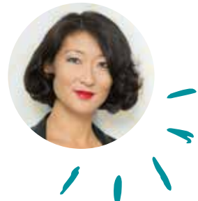
Fleur Pellerin Chairwoman of the Mission Committee.

→ 0 new funding for oil and gas projects since October 2021